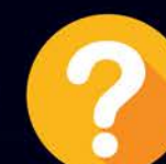
More to come

Plus our community of MSP/MSSP/SOC members to ensure everything stays on the right track!